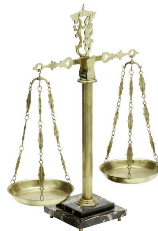
Merlin Law Group